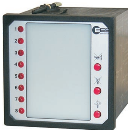
SSM 8 A-1