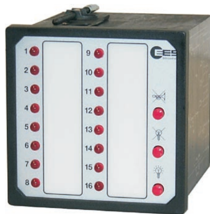
SSM 16 A-1